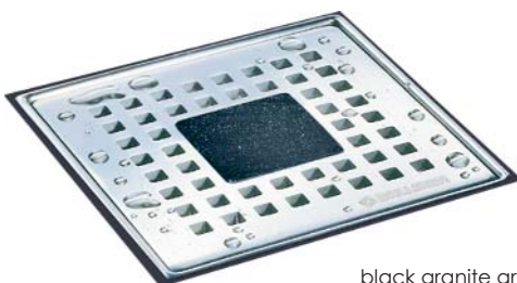
black granite grate